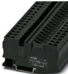
Fuse terminal block with LED for mounting on NS 35, for miniature circuit breakers, terminal width: 8.2 mm, color: Black

Please be informed that the data shown in this PDF Document is generated from our Online Catalog. Please find the complete data in the user's documentation. Our General Terms of Use for Downloads are valid ( http://phoenixcontact.com/download )