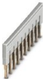
Plug-in bridge, pitch: 6.2 mm, width: 60.3 mm, number of positions: 10, color: gray

Please be informed that the data shown in this PDF Document is generated from our Online Catalog. Please find the complete data in the user's documentation. Our General Terms of Use for Downloads are valid ( http://phoenixcontact.com/download )