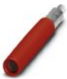
Female test connector, color: red

Female test connector - PSBJ-URTK 6 RD - 3026719