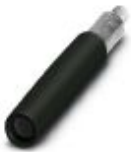
Female test connector, color: black

Female test connector - PSBJ-URTK 6 BK - 3026447