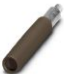
Female test connector, color: brown

Female test connector - PSBJ-URTK 6 BN - 3026971