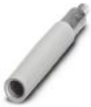
Female test connector, color: transparent

Female test connector - PSBJ-URTK 6 FARBLOS - 3026450