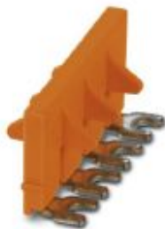
Switching jumper, pitch: 8.2 mm, width: 31.7 mm, number of positions: 4, color: orange

Please be informed that the data shown in this PDF Document is generated from our Online Catalog. Please find the complete data in the user's documentation. Our General Terms of Use for Downloads are valid ( http://phoenixcontact.com/download )