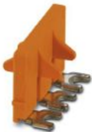
Switching jumper, pitch: 8.2 mm, width: 23.5 mm, number of positions: 3, color: orange

Please be informed that the data shown in this PDF Document is generated from our Online Catalog. Please find the complete data in the user's documentation. Our General Terms of Use for Downloads are valid ( http://phoenixcontact.com/download )