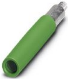
Female test connector, color: green

Please be informed that the data shown in this PDF Document is generated from our Online Catalog. Please find the complete data in the user's documentation. Our General Terms of Use for Downloads are valid ( http://phoenixcontact.com/download )