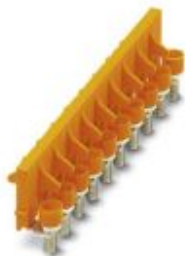
Switching jumper, pitch: 8.2 mm, width: 80.9 mm, number of positions: 10, color: orange

Please be informed that the data shown in this PDF Document is generated from our Online Catalog. Please find the complete data in the user's documentation. Our General Terms of Use for Downloads are valid ( http://phoenixcontact.com/download )