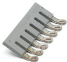
Insertion bridge, pitch: 9 mm, number of positions: 7, color: gray

Please be informed that the data shown in this PDF Document is generated from our Online Catalog. Please find the complete data in the user's documentation. Our General Terms of Use for Downloads are valid ( http://phoenixcontact.com/download )