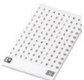
Marker card, Card, can be ordered: by card, white, labeled according to customer specifications, mounting type: adhesive, for terminal block width: 4.15 mm, lettering field size: continuous x 3.8#mm

Marker card - SK 3,8 REEL P4,15 WH CUS - 0825990