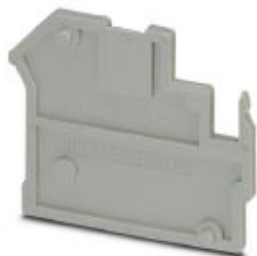
Spacer plate, pitch: 0 mm, length: 47.7 mm, width: 2.4 mm, number of positions: 1, color: gray

Please be informed that the data shown in this PDF Document is generated from our Online Catalog. Please find the complete data in the user's documentation. Our General Terms of Use for Downloads are valid ( http://phoenixcontact.com/download )