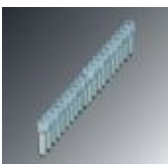
Fixed bridge, pitch: 5 mm, number of positions: 20, color: silver