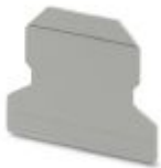
Partition plate, length: 56 mm, width: 1.5 mm, height: 45.7 mm, color: gray