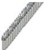
Fixed bridge, pitch: 5 mm, number of positions: 80, color: silver