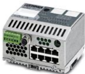
Ethernet Smart Managed Compact Switch with eight 10/100 Mbps RJ45 ports, PROFINET mode (default)

Please be informed that the data shown in this PDF Document is generated from our Online Catalog. Please find the complete data in the user's documentation. Our General Terms of Use for Downloads are valid ( http://phoenixcontact.com/download )