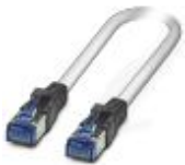
Patch cable, CAT6, pre-assembled, 20.0 m

Patch cable - FL CAT6 PATCH 20,0 - 2891576