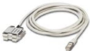
The figure shows a comparable item from Phoenix Contact

Cable adapter for PSR over-speed safety relays (PSR-RSM4 and PSR-MM30), 15/8-pos., cable length: 2.5 m, for controller: Siemens, Heidenhain