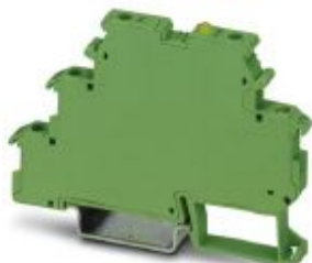
Power solid-state relay terminal block for actuator, input: 24 V DC, output: 3 - 30 V DC/3 A, terminal block width: 6.2 mm

Please be informed that the data shown in this PDF Document is generated from our Online Catalog. Please find the complete data in the user's documentation. Our General Terms of Use for Downloads are valid ( http://phoenixcontact.com/download )