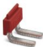
Insertion bridge, pitch: 6.15 mm, number of positions: 2, color: red

Insertion bridge - EB 2- DIK RD - 2716693