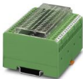
Diode module, with 32 diodes, common anode, diode type 1N 4007

Please be informed that the data shown in this PDF Document is generated from our Online Catalog. Please find the complete data in the user's documentation. Our General Terms of Use for Downloads are valid ( http://phoenixcontact.com/download )