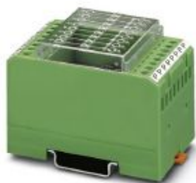
Diode module, with eight diodes, common cathode, diode type 1N 5408

Please be informed that the data shown in this PDF Document is generated from our Online Catalog. Please find the complete data in the user's documentation. Our General Terms of Use for Downloads are valid ( http://phoenixcontact.com/download )