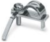
Shield connection clamp for printed circuit terminal block

Shield connection clamp - ME-SAS - 2853899