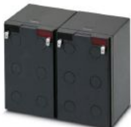
Replacement battery for UPS-BAT/VRLA... energy storage

Please be informed that the data shown in this PDF Document is generated from our Online Catalog. Please find the complete data in the user's documentation. Our General Terms of Use for Downloads are valid ( http://phoenixcontact.com/download )