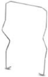
Relay retaining bracket, wire model, suitable for RIF-4 relay base

Please be informed that the data shown in this PDF Document is generated from our Online Catalog. Please find the complete data in the user's documentation. Our General Terms of Use for Downloads are valid ( http://phoenixcontact.com/download )