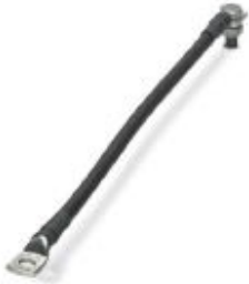
Connecting cable for FLT-ISG-100-EX, length 300 mm.

Please be informed that the data shown in this PDF Document is generated from our Online Catalog. Please find the complete data in the user's documentation. Our General Terms of Use for Downloads are valid ( http://phoenixcontact.com/download )