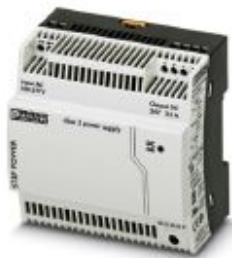
DIN rail power supply unit 24 V DC/3.5 A, primary switched-mode, 1-phase.

Please be informed that the data shown in this PDF Document is generated from our Online Catalog. Please find the complete data in the user's documentation. Our General Terms of Use for Downloads are valid ( http://phoenixcontact.com/download )