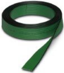
SmartWire DT™ 100 m flat-ribbon conductor, 8-pos.

Please be informed that the data shown in this PDF Document is generated from our Online Catalog. Please find the complete data in the user's documentation. Our General Terms of Use for Downloads are valid ( http://phoenixcontact.com/download )