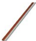
Continuous plug-in bridge, length: 500 mm, color: red

Continuous plug-in bridge - FBST 500-PLC RD - 2966786