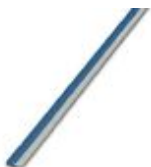
Continuous plug-in bridge, length: 500 mm, color: blue

Continuous plug-in bridge - FBST 500-PLC BU - 2966692