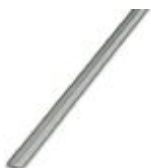
Continuous plug-in bridge, length: 500 mm, color: gray

Continuous plug-in bridge - FBST 500-PLC GY - 2966838