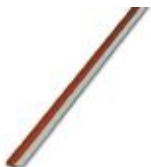
Continuous plug-in bridge, length: 500 mm, color: red

Continuous plug-in bridge - FBST 500-PLC RD - 2966786