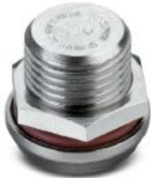
Plug, M20, for FB... enclosure

Please be informed that the data shown in this PDF Document is generated from our Online Catalog. Please find the complete data in the user's documentation. Our General Terms of Use for Downloads are valid ( http://phoenixcontact.com/download )