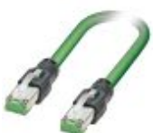
PROFINET patch cable, shielded, star-quad, 22 AWG stranded (7-wire), green, straight RJ45 male connector/IP20 to straight RJ45 male connector/IP20, length: 1.0 m

Patch cable - NBC-R4AC/1,0-93B/R4AC - 1408968