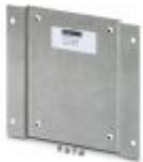
Mounting plate for SFNT switches

Mounting plate - FL PA SFNT 5-8 - 2891012