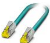
Patch cable, CAT6 A , 4-pair, shielded, connection not crossed (line), assembled at both ends with RJ45/IP20 connectors, outer sheath material: PUR, length: 3.0 m

Patch cable - NBC-R4AC/10G-R4AC/10G-94F/3,0 - 1408365