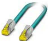
Patch cable, CAT6 A , 4-pair, shielded, connection not crossed (line), assembled at both ends with RJ45/IP20 connectors, outer sheath material: PUR, length: 2.0 m

Patch cable - NBC-R4AC/10G-R4AC/10G-94F/2,0 - 1408360