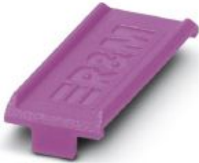
Color marking for FL PATCH GUARD, purple

Please be informed that the data shown in this PDF Document is generated from our Online Catalog. Please find the complete data in the user's documentation. Our General Terms of Use for Downloads are valid ( http://phoenixcontact.com/download )