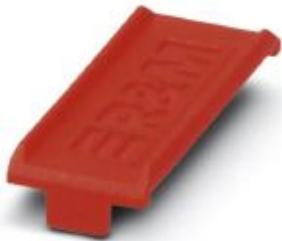
Color marking for FL PATCH GUARD, red

Please be informed that the data shown in this PDF Document is generated from our Online Catalog. Please find the complete data in the user's documentation. Our General Terms of Use for Downloads are valid ( http://phoenixcontact.com/download )