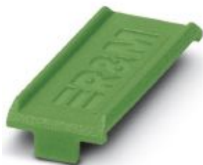
Color marking for FL PATCH GUARD, green

Please be informed that the data shown in this PDF Document is generated from our Online Catalog. Please find the complete data in the user's documentation. Our General Terms of Use for Downloads are valid ( http://phoenixcontact.com/download )