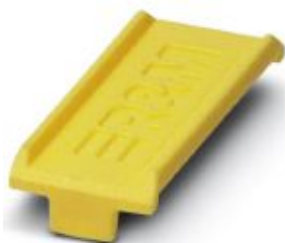
Color marking for FL PATCH GUARD, yellow

Please be informed that the data shown in this PDF Document is generated from our Online Catalog. Please find the complete data in the user's documentation. Our General Terms of Use for Downloads are valid ( http://phoenixcontact.com/download )