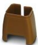
Color marking for patch cable, brown

Color-coding - FL PATCH CCODE BN - 2891495