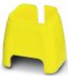
Color marking for patch cable, yellow

Color-coding - FL PATCH CCODE YE - 2891592