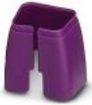
Color marking for patch cable, purple

Color-coding - FL PATCH CCODE VT - 2891990