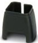
Color marking for patch cable, black

Color-coding - FL PATCH CCODE BK - 2891194