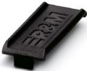
Color marking for FL PATCH GUARD, black

Please be informed that the data shown in this PDF Document is generated from our Online Catalog. Please find the complete data in the user's documentation. Our General Terms of Use for Downloads are valid ( http://phoenixcontact.com/download )