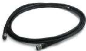
The figure shows a version of the product

Antenna cable, outside diameter: 10 mm (0.4 in.), inner conductor: stranded, attenuation: 1.0 / 1.8 / 3.1 dB at 0.9 / 2.4 / 5.8 GHz, connection: 2 x N (male), cable length: 3 m (10 ft.)