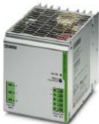
DIN rail power supply unit, primary-switched, 1-phase, input: 600 V DC, output: 24 V DC/20 A

Please be informed that the data shown in this PDF Document is generated from our Online Catalog. Please find the complete data in the user's documentation. Our General Terms of Use for Downloads are valid ( http://phoenixcontact.com/download )