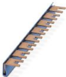
Wiring bridge for modules with connecting pitch 17.5 mm, 1-phase, 8-pos., color: Blue

Please be informed that the data shown in this PDF Document is generated from our Online Catalog. Please find the complete data in the user's documentation. Our General Terms of Use for Downloads are valid ( http://phoenixcontact.com/download )