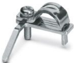
Shield connection clamp for printed circuit terminal block

Please be informed that the data shown in this PDF Document is generated from our Online Catalog. Please find the complete data in the user's documentation. Our General Terms of Use for Downloads are valid ( http://phoenixcontact.com/download )