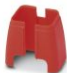
Security element for FL patch cable

Port Guard Security Element - FL PATCH SAFE CLIP - 2891246