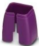
Color marking for patch cable, purple

Color-coding - FL PATCH CCODE VT - 2891990