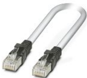
Patch cable, CAT5, assembled, 5 m

Please be informed that the data shown in this PDF Document is generated from our Online Catalog. Please find the complete data in the user's documentation. Our General Terms of Use for Downloads are valid ( http://phoenixcontact.com/download )