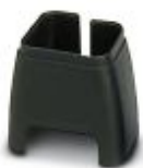
Color marking for patch cable, black

Color-coding - FL PATCH CCODE BK - 2891194