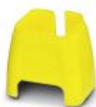
Color marking for patch cable, yellow

Color-coding - FL PATCH CCODE YE - 2891592