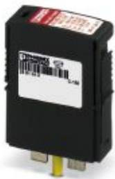
L-N replacement plug for VAL-MS-T1/T2 48/12.5 plug-in lighting/surge arrester.

Please be informed that the data shown in this PDF Document is generated from our Online Catalog. Please find the complete data in the user's documentation. Our General Terms of Use for Downloads are valid ( http://phoenixcontact.com/download )