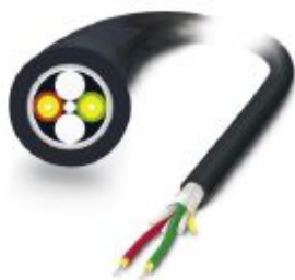
PCF cable, duplex 200/230 µm, by the meter, without connector, for outdoor installation

Please be informed that the data shown in this PDF Document is generated from our Online Catalog. Please find the complete data in the user's documentation. Our General Terms of Use for Downloads are valid ( http://phoenixcontact.com/download )