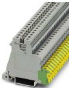
Sensor/actuator terminal block, connection method: Screw connection, cross section: 0.2 mm 2 - 4 mm 2 , AWG: 24 - 12, width: 6.2 mm, color: gray, mounting type: NS 35/7,5, NS 35/15

Please be informed that the data shown in this PDF Document is generated from our Online Catalog. Please find the complete data in the user's documentation. Our General Terms of Use for Downloads are valid ( http://phoenixcontact.com/download )