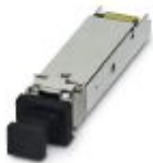
The small form-factor plug-in module provides a fiber optic interface with a data transmission speed of 100 Mbps with a wavelength of 1310 nm (long).

Media module - FL SFP FE WDM20-SET - 2702439