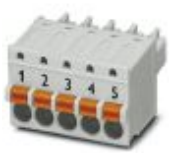
PCB connector, nominal current: 8 A, rated voltage (III/2): 160 V, nominal cross section: 1.5 mm 2 , number of positions: 5, pitch: 3.81 mm, connection method: Push-in spring connection, color: light gray, contact surface: Tin

Printed-circuit board connector - FK-MCP 1,5/ 5-ST-3,81GY35BD1-5 - 1015782