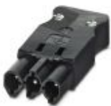
Connector for series connection, black, 3-pos.