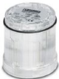
LED permanent light element, 24 V DC, 7 colors

Please be informed that the data shown in this PDF Document is generated from our Online Catalog. Please find the complete data in the user's documentation. Our General Terms of Use for Downloads are valid ( http://phoenixcontact.com/download )