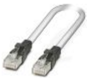
Patch cable, CAT5, assembled, 5 m

Patch cable - FL CAT5 PATCH 5,0 - 2832580