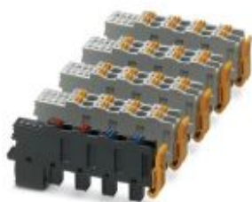
Axioline F connector set (for e.g., AXL F DO32/1 1F)

Please be informed that the data shown in this PDF Document is generated from our Online Catalog. Please find the complete data in the user's documentation. Our General Terms of Use for Downloads are valid ( http://phoenixcontact.com/download )