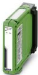
PROFIBUS power module

Please be informed that the data shown in this PDF Document is generated from our Online Catalog. Please find the complete data in the user's documentation. Our General Terms of Use for Downloads are valid ( http://phoenixcontact.com/download )