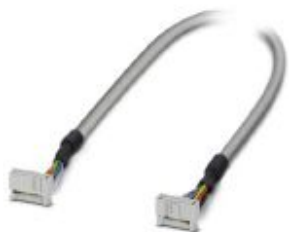
Round cable set; connection 1: IDC/FLK socket strip (1x 10-position); connection 2: IDC/FLK socket strip (1x 10-position); cable length: 6 m

Please be informed that the data shown in this PDF Document is generated from our Online Catalog. Please find the complete data in the user's documentation. Our General Terms of Use for Downloads are valid ( http://phoenixcontact.com/download )