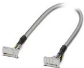
Round cable set; connection 1: IDC/FLK socket strip (1x 14-position); connection 2: IDC/FLK socket strip (1x 14-position); cable length: 2 m

Please be informed that the data shown in this PDF Document is generated from our Online Catalog. Please find the complete data in the user's documentation. Our General Terms of Use for Downloads are valid ( http://phoenixcontact.com/download )