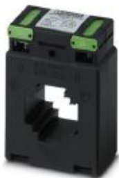
Window-type current transformer, 300 A AC primary current; 5 A AC secondary current; accuracy class 1; 7.5 VA rated power

Please be informed that the data shown in this PDF Document is generated from our Online Catalog. Please find the complete data in the user's documentation. Our General Terms of Use for Downloads are valid ( http://phoenixcontact.com/download )